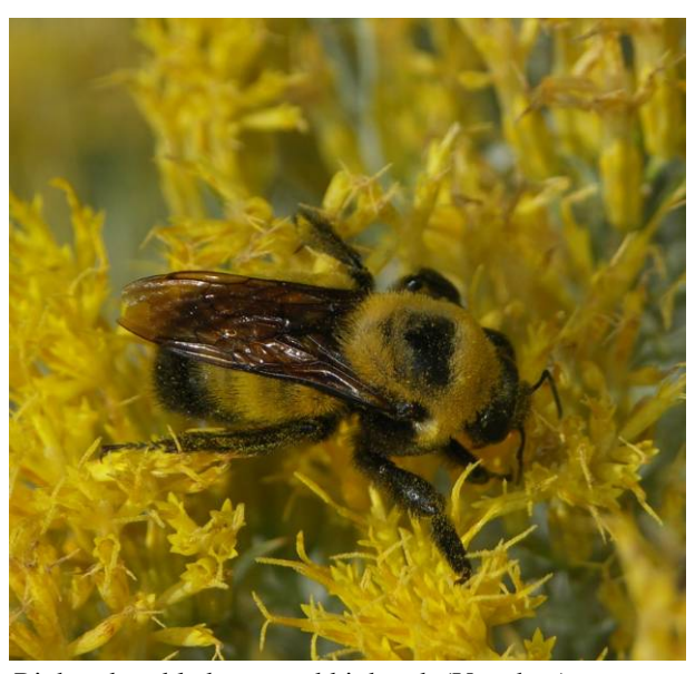
Right – bumble bee on rabbit brush (Vaughan)

The purpose of this technical note is to provide information about establishing, maintaining and enhancing habitat and food resources for native pollinators, particularly for native bees, in Riparian buffers, Windbreaks, Hedgerows, Alley cropping, Field borders, Filter strips, Waterways, Range plantings and other NRCS practices. We welcome your comments for improving any of the content of this publication for future editions. Please contact us!